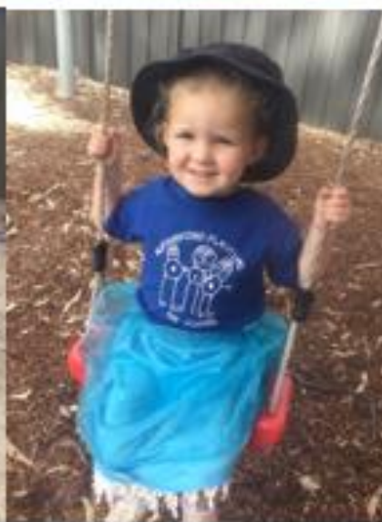
Tweenie Room Photos ☺